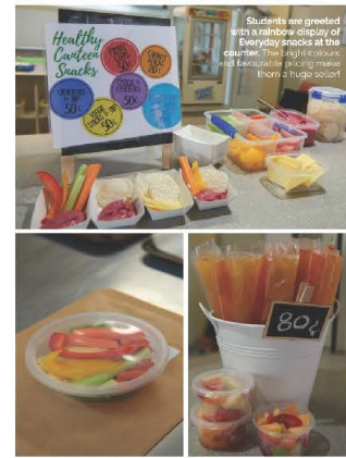
See the spread. One packaging helps attract students to these suggestions, kept fresh, available and able to be used in the canteen.